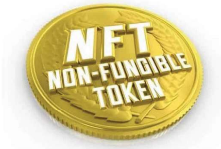
Figure 1.1: NFT Token

NFTs are becoming increasingly popular as a means of purchasing and selling digital artwork. NFTs have unique identifying codes. Figure 1.1 describes the token of NFTs: