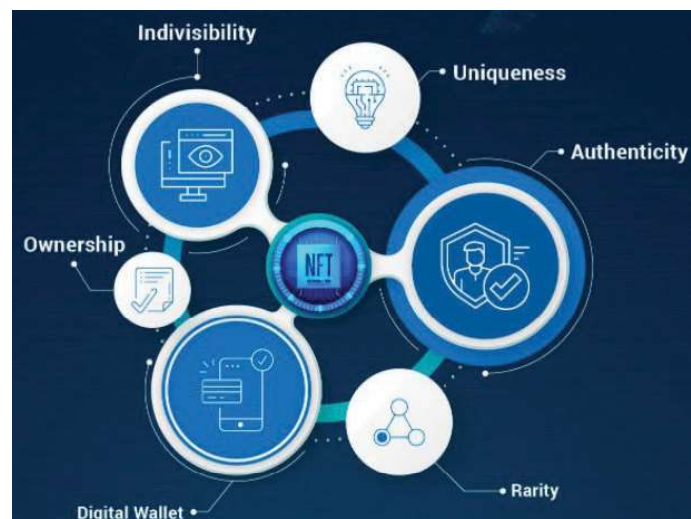
Figure 1.2: Features of NFTs

Figure 1.2 describes the various features of NFTs: