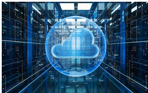
Figure 1.1: Cloud computing

You could still manage the storage with extra hard disk drives (HDDs) and solid-state drives (SSDs) till you go beyond a certain point. But soon, what you might realize is that buying more stuff corresponds to more costs not only in terms of purchase but maintenance as well because you will now need a technical team to handle the disaster/fault recovery cases. Also, it is not always true that you utilize whatever you purchase to the fullest. This underutilization is another overhead. This is exactly the problem that a lot of tech companies often face as they install more and more servers on their premises. The following is a popular hologram of cloud computing (refer to Figure 1.1 ):