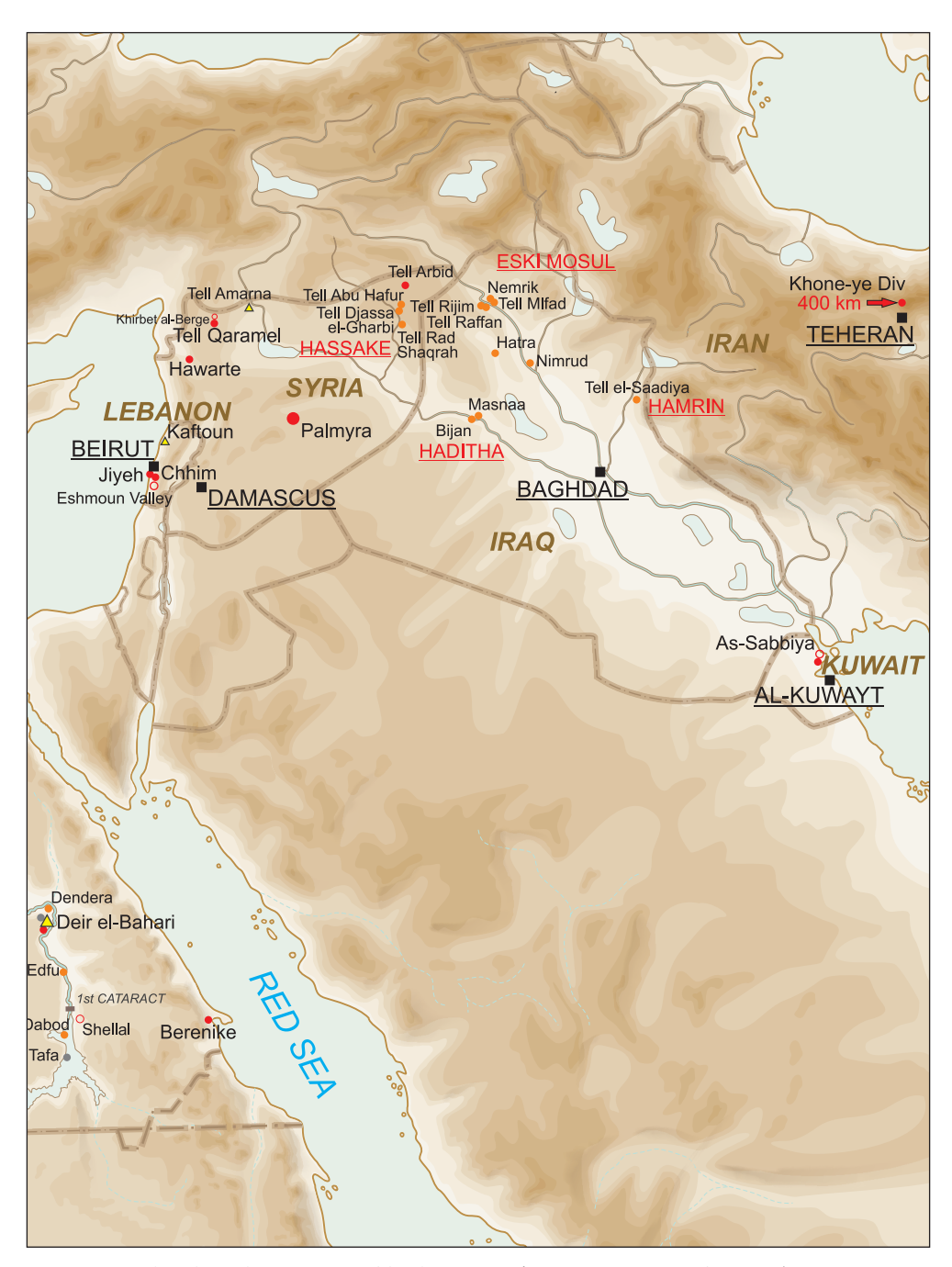
Map B. Archaeological sites excavated by the PCMA (Syria, Iran, Iraq and Kuwait)